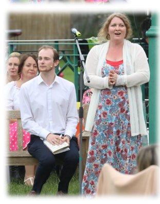
And This is My Beloved Wright & Forrest (Kismet)