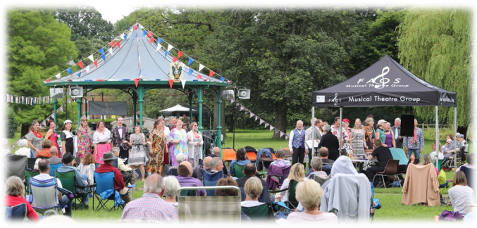
Crazy Little Thing Called Love - Queen