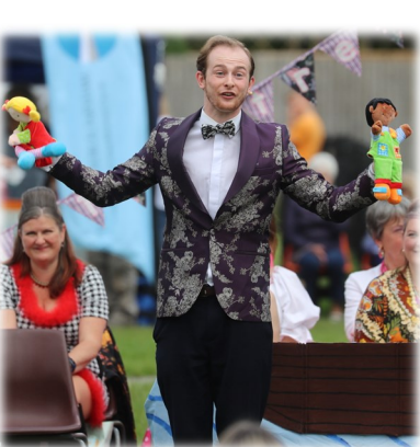
Leonard Bernstein (West Side Story) Menken & Ashman